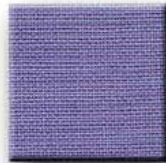
LAVENDER ART CLOTH