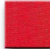
RED ART CLOTH