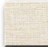
CREAM ART CLOTH