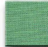
GREEN ART CLOTH