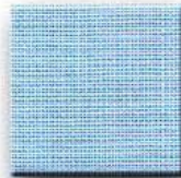
BABY BLUE ART CLOTH