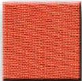
ORANGE ART CLOTH