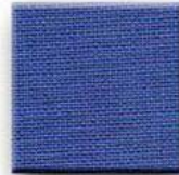
BLUE ART CLOTH