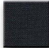
BLACK ART CLOTH